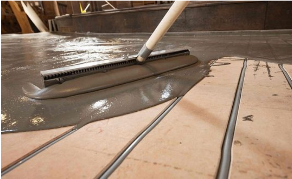
Completed Works: NORIT-Underfloor Heating System